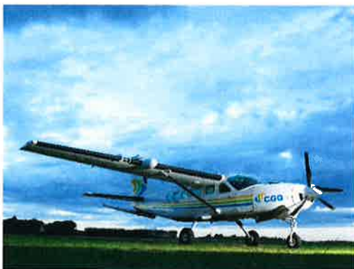
One of CGG's planes to be used for the survey