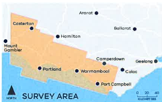
Map of the survey area

Further information can be found at earthresources.vic.gov.au/gasprogram or by calling 136 186 or email to VGP@ecodev.vic.gov.au