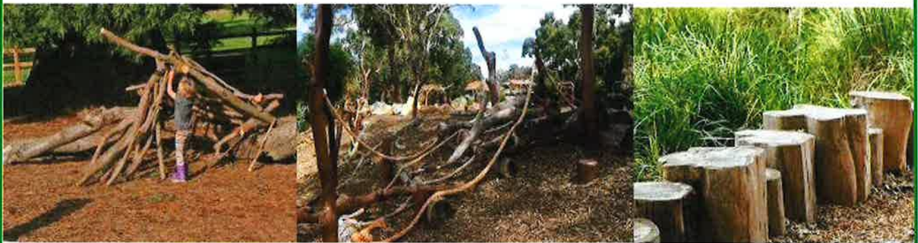
Some examples of the types of activities to be found in nature based play spaces.

It will add to the already popular ducks, cannon and tree roots so valued by children and families over many years. It would be a lasting asset for Warrnambool.